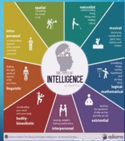
Source: Frames of Mind: The Theory of Multiple Intelligences, Howard Gardner (1983)