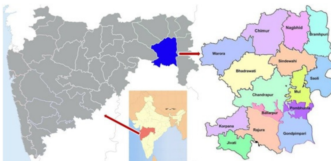
Fig. 1: Location of Chandrapur district.