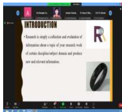
Day 7-Session II: Speaker Dr. S. B. Kishore

Day 7: Feedback link of session 1 - https://forms.gle/Y6cZdsBXyC2tCghQ6 session 2- https://forms.gle/39PqQyEm2B8HNw8x5