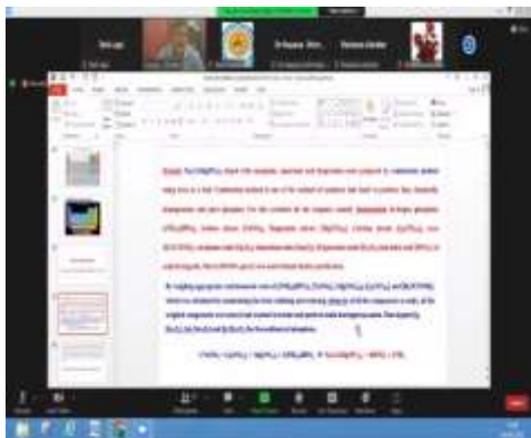
Day 4-Session I: Speaker Dr.Sanjay Dhobale